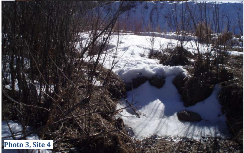
Photo 3, Site 4

improve the stability, natural and beneficial functions, and improve water quality of the stream. In November 2016, Muller Engineering Company (MEC) prepared the 2016 McMurdo Gulch Reach Assessment (MGRA). 3 MEC started their monitoring and assessment at the upstream end of McMurdo Gulch and continued downstream approximately 4.9 miles (see green line in Figure 1 ).