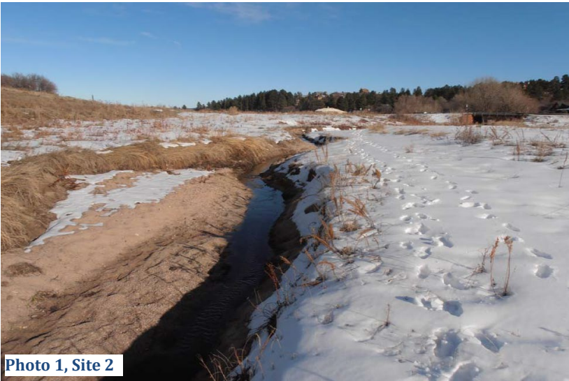
Photo 1, Site 2