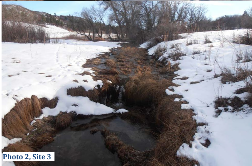
Photo 2, Site 3